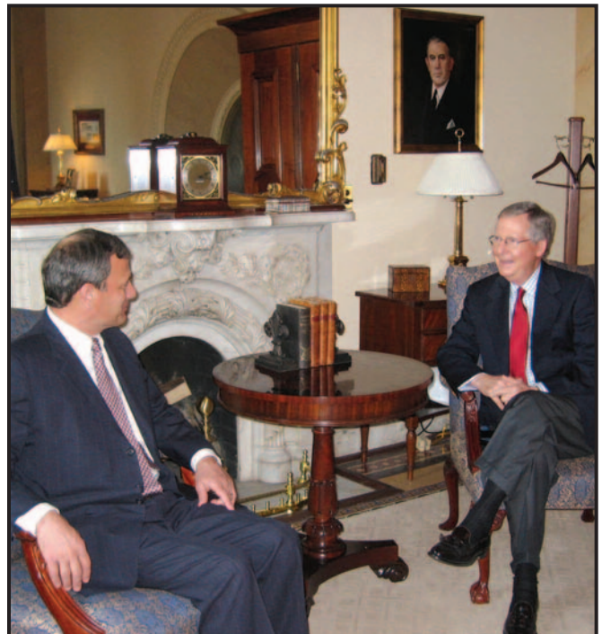
U.S. Senate Majority Whip Mitch McConnell met with Supreme Court nominee Judge John Roberts in his office in the U.S. Capitol.